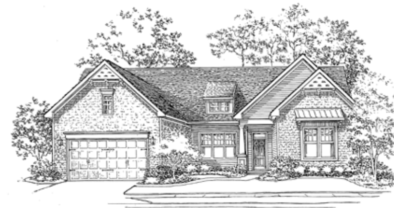
ELEVATION B Cottage Style