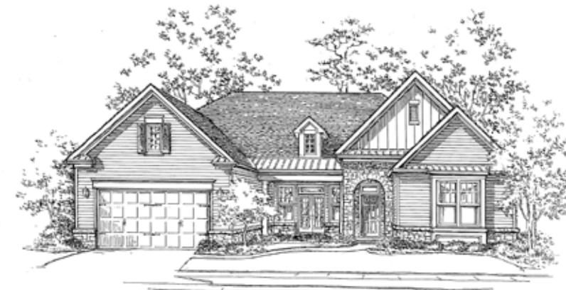
ELEVATION C Traditional