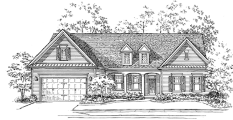
ELEVATION A Country Flair