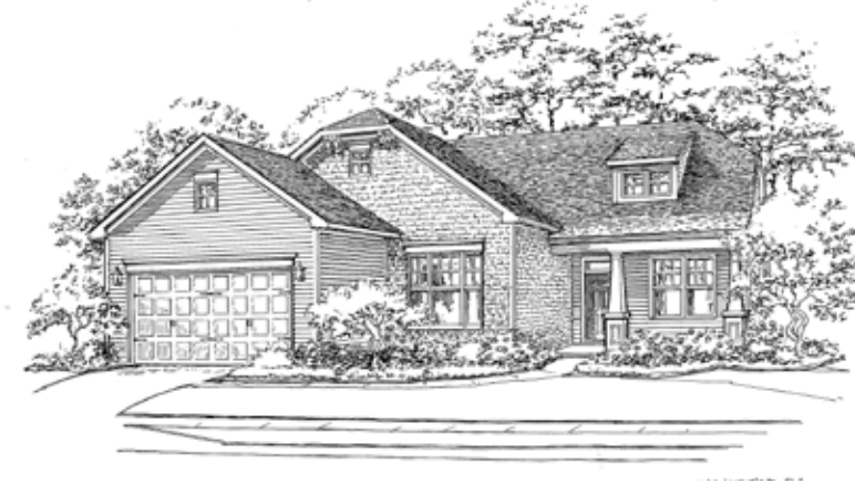
ELEVATION B Cottage Style