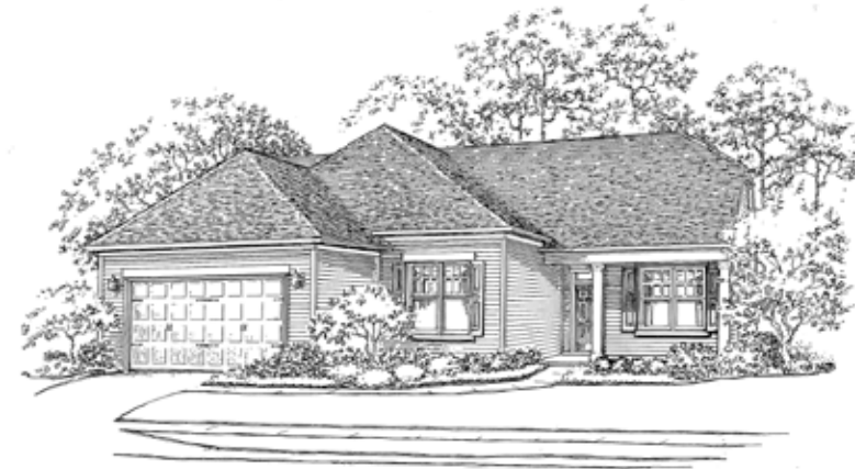
ELEVATION C Traditional