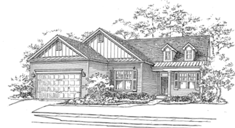
ELEVATION A Country Flair